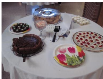
No Dessert Fest would be complete without the delectable desserts!