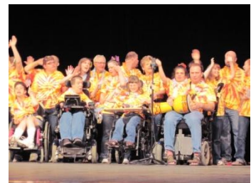
The Gate Crashers perform at the April Foolies.